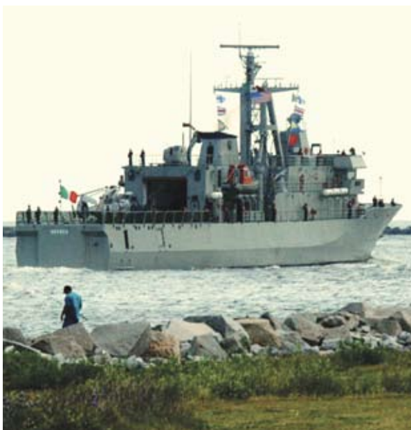
The Mexican Navy launched its fourth Oaxaca -class patrol ship in 2009. Current plans call for two additional units to enter service by 2013.

The U.S. Navy remains committed to a goal of building 55 littoral combat ships. Amid major cost overruns, the first LCS, the USS Freedom (LCS-1), was commissioned in November 2008, and the second ship, the USS Independence (LCS-2), entered service in January 2010. The ships are based on two separate and competing models with the Navy set to down-select and move forward on a single design some time in the future. The third and fourth LCS units, to be named the USS