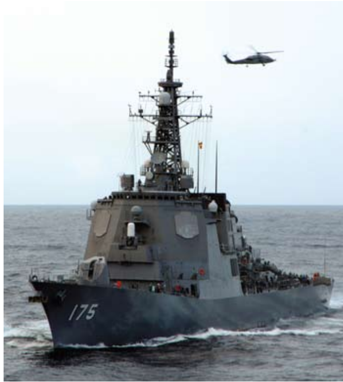
In 2009 the Japanese destroyer Myoko successfully intercepted a ballistic-missile target off Hawaii.

Dalpele class. The first two units were built in South Korea with the remainder built domestically. The Indonesian fleet also saw a number of smaller 40-meter patrol boats join the ranks early in 2009.