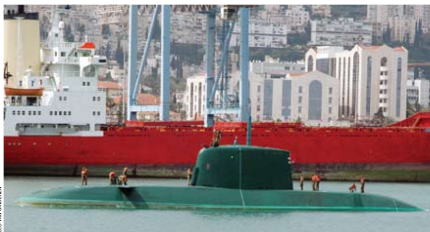
In mid-2009 an Israeli Dolphin-class submarine passed through the Suez Canal for the first time, largely as a show of strength in the face of Iranian saber-rattling.

Somalia has turned into the international hub of maritime piracy in recent years; the attempted hijacking of the merchant ship Maersk Alabama and the U.S. Navy's dramatic at-sea rescue of Captain Richard Phillips illuminated the problem to a worldwide audience. As an unprecedented international naval armada sails together in the Gulf of Aden to stem the tide of piracy, Somalia's unstable government urges help in its battle against insurgents. The European Union has begun training some 2,000 Somali security forces and the Somali government is working to establish a 500-person coast guard. Unfortunately,