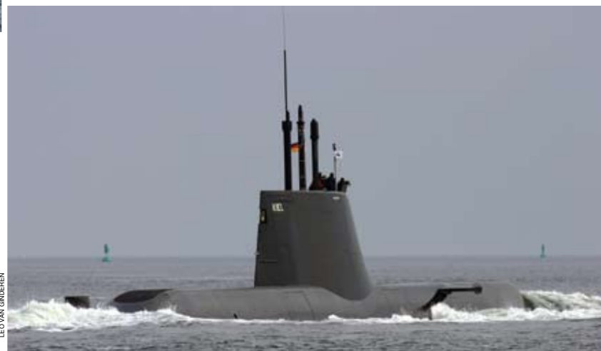
Papanikolis , the German-built first unit of Greece's submarine force, may be sold abroad or possibly accepted into the German fleet following disputes over Greek non-payment.

In early 2009 the French aircraft carrier Charles de Gaulle had just completed a lengthy overhaul but was returned to the yard when officials discovered excessive