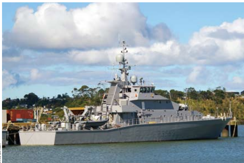
HMNZS Rotaiti is one of four inshore patrol vessels that entered service under New Zealand's Project Protector program.

Pakistan continues to increase its defense ties with China, and in September 2009 the Pakistani Navy took delivery of its newest and most advanced warship, the Chinese-built F-22P frigate Zulfiquar . The ship, based on the Chinese Jiangwei-II -class (Project 53H3) frigate, was officially handed over on 30 July. The order for the Zulfiquar and three sister ships, also known in Pakistan as the Sword class, was finalized in 2005. Two units of the class, the