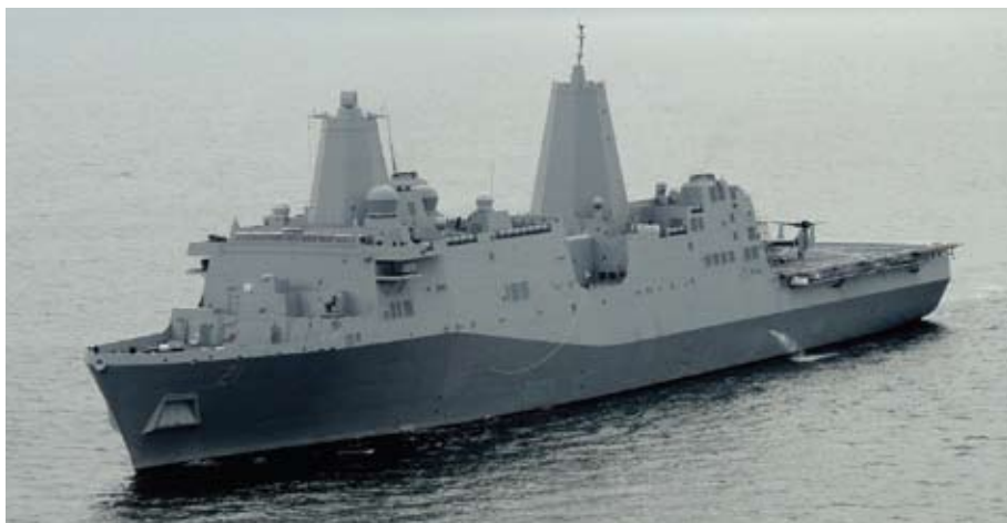
The U.S. Navy commissioned the USS New York (LPD-21) in November 2009. Forged into her bow are 7.5 tons of steel salvaged from the World Trade Center towers.

The first of Venezuela's 99-meter 2,300-ton offshore patrol vessels are due for delivery in mid-2010 with three additional units to follow by 2011. Four smaller 80-meter 1,500-ton coastal patrol boats are all expected to be in service by 2010 or 2011. The Sabalo , the first of Venezuela's Type 209/1300-class submarines, completed its five-year upgrade in Germany in 2009. The submarine's modernization, which included new engineering, mast, snorkel, and computer systems, has reportedly led to a reduction in the vessel's acoustic signature. Venezuela's planned acquisition of six Kilo-class submarines has been called off, with the class instead being completed for Vietnam. ❄