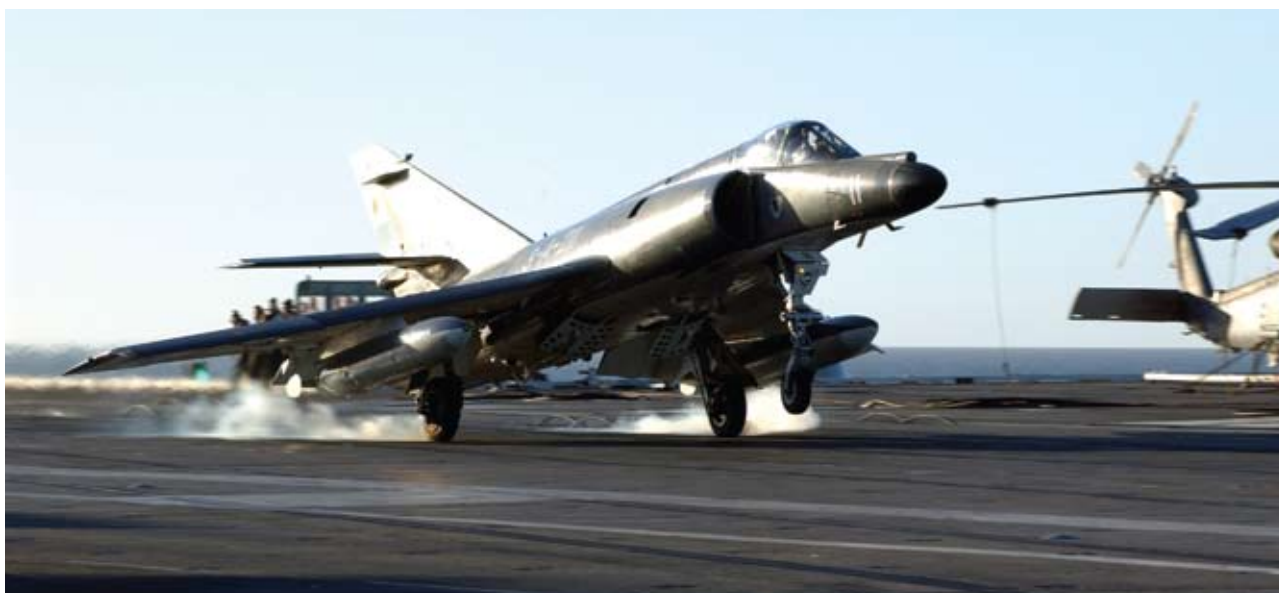
Ten of Argentina's Super Étendard fighter-bombers are to be upgraded and modernized in France during the near future.