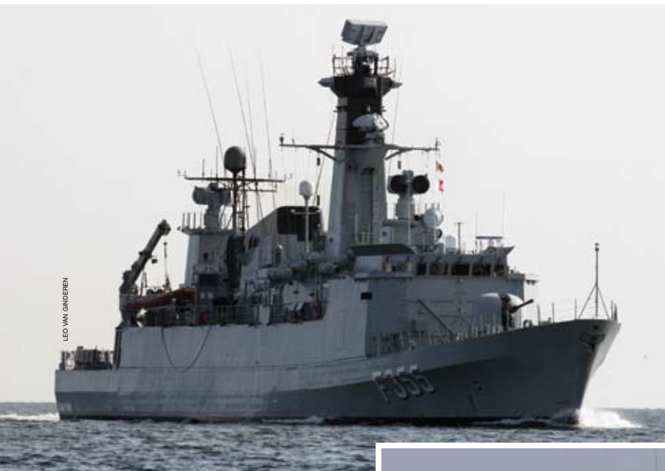
Denmark's three highly capable and well-armed Niels Juel -class missile corvettes, including Olfert Fischer , were recently decommissioned.

it will largely host ground and air forces, port capabilities are being expanded to accept French naval vessels likely to cycle through the facility.