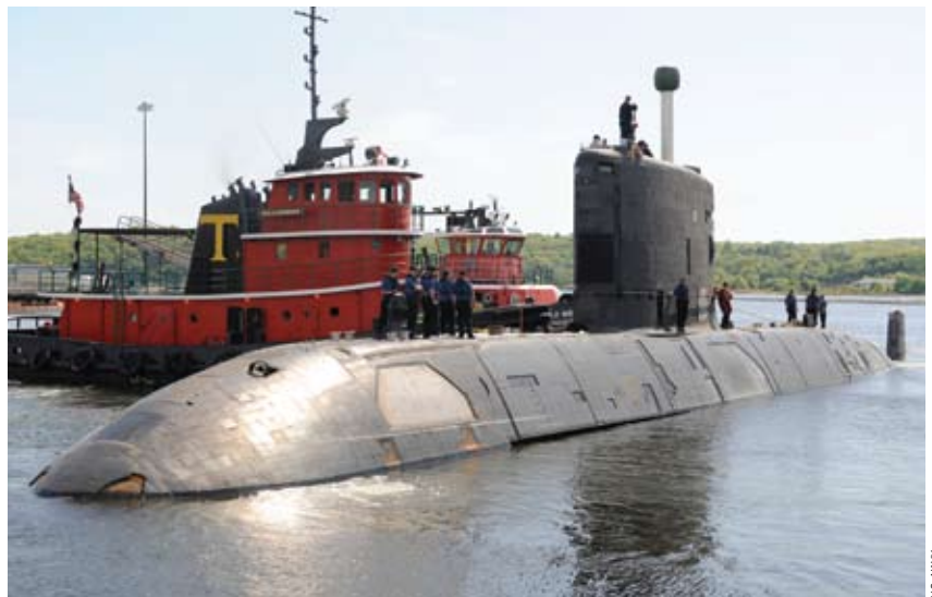
The Canadian submarine HMCS Corner Brook will begin an extended docking period in 2011. Sisters Victoria and Windsor are to return to the fleet by late 2010 and early 2011 respectively, while Chicoutimi is scheduled to re-enter service in 2012.

Two of Colombia's new domestically produced helicopter-carrying 370-ton river patrol boats were delivered in 2009, and